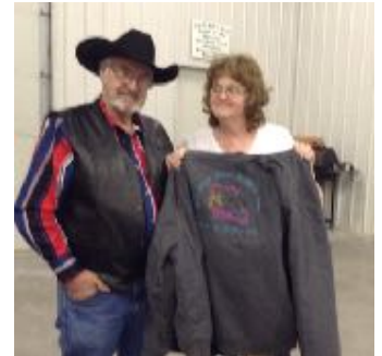
2017 MDHMA Annual Meeting