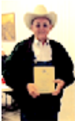
Lynch Pin Award