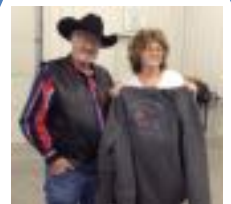
Member of the Year Award

like to send out a huge thank you to everyone for a very good sale, our treasury looks very good for the next year.